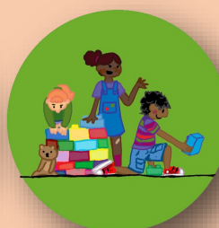
Education Works in Pre-school