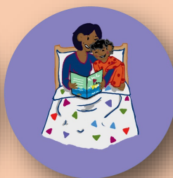
Big Bedtime Read