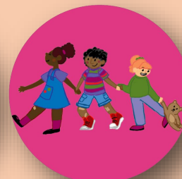
Happy Healthy Kids